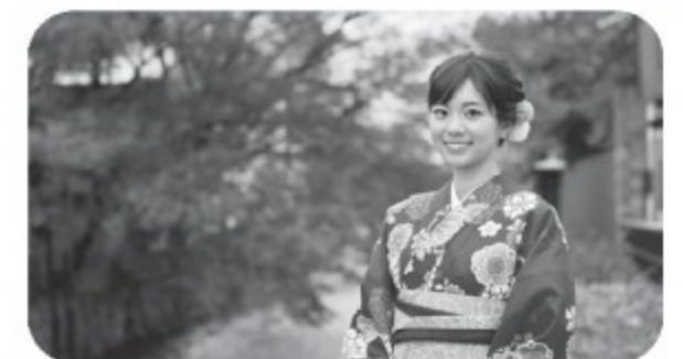
6 _____ from Japan.