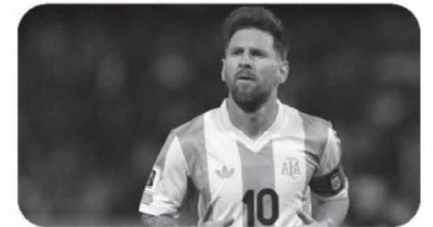
4 _____ from Argentina.