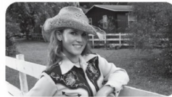
1 She's from the United States.

a Complete the sentences with He's , She's , or It's .