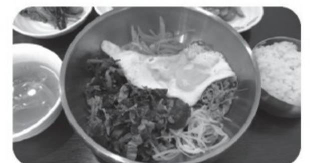
8 _____ from Korea.