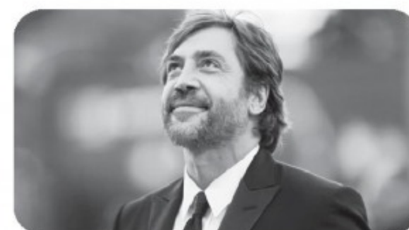
7 _____ from Spain.