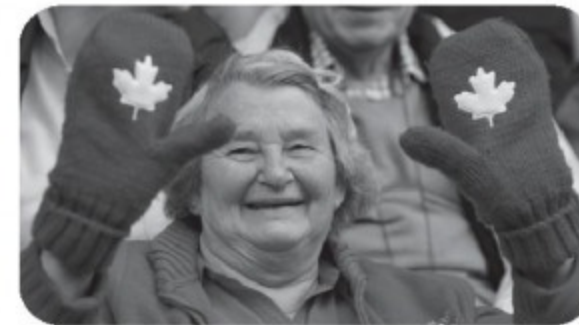
3 _____ from Canada.