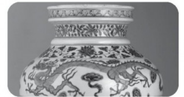
2 It's from China.