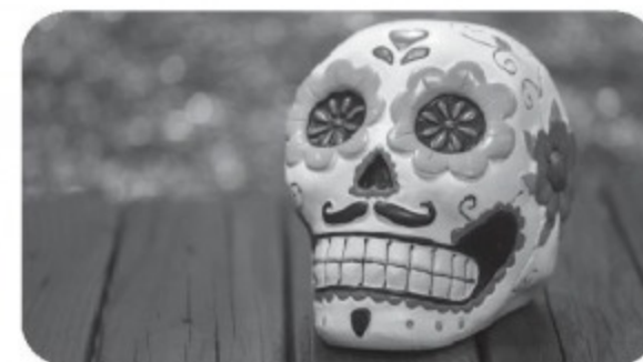
5 _____ from Mexico.