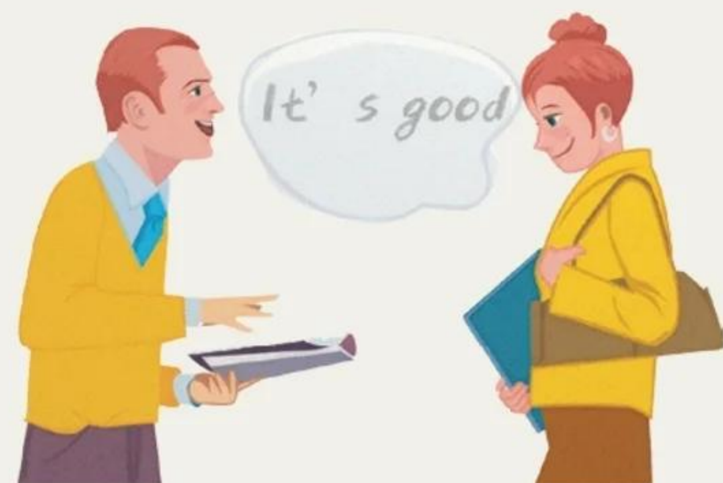
Americans speak English.