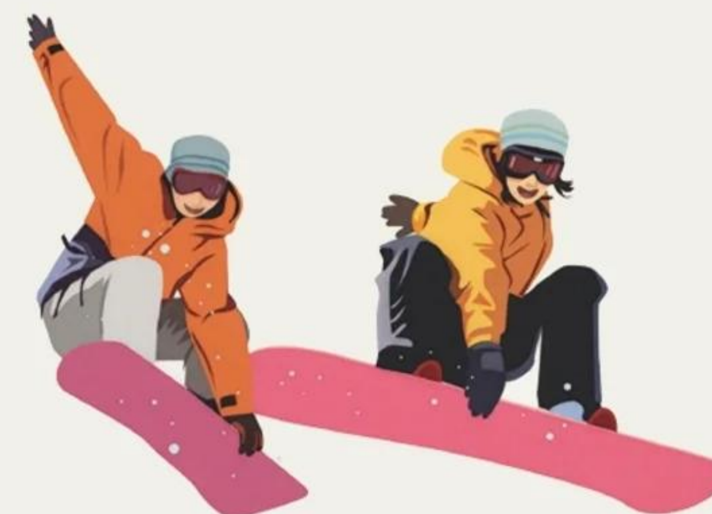
They like winter.