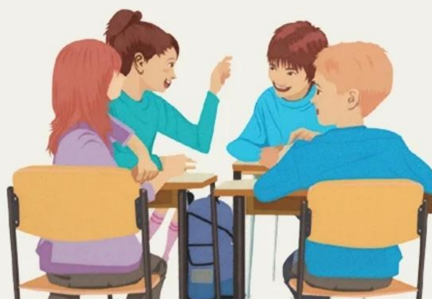
The class is not over.