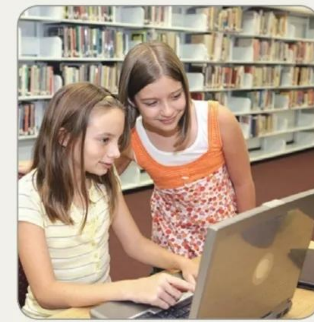
We surf the Internet.