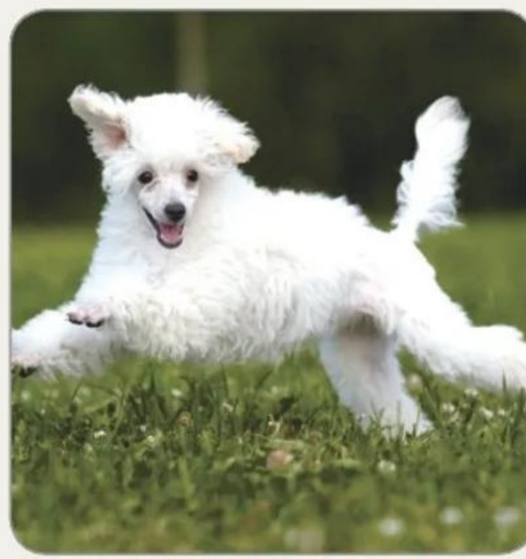
The puppy jumps.