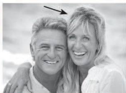
6 i f w e .....

8 Complete the words for people with the vowels (a, e, i, o, u).