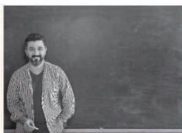
2 r e e t c h a .....