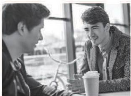
3 n d f r i e .....