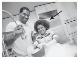
4 n s o .....