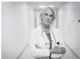
1 c d o r o t doctor

7 Look at the photos. Put the letters in the correct order and write the words.