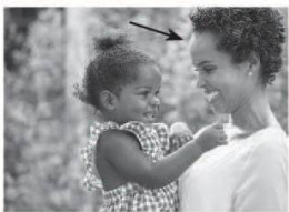
5 t h e r o m .....