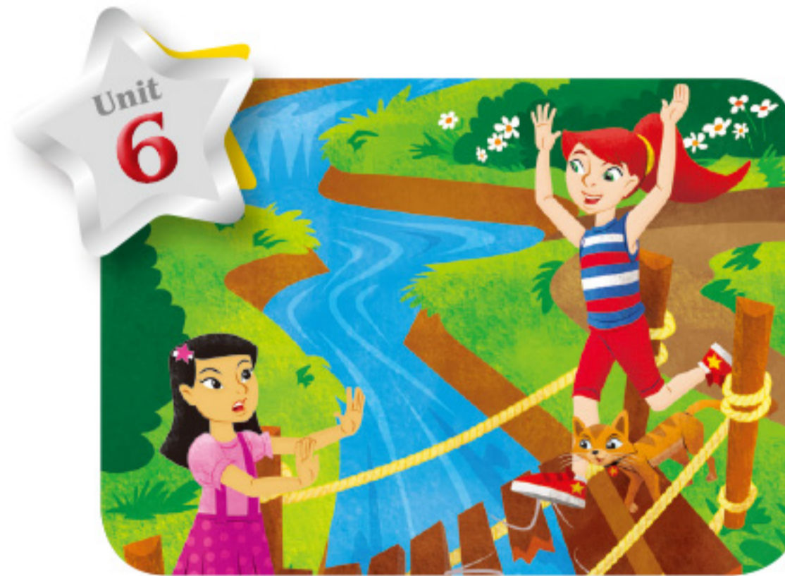
Summer Camp 56

long vowel o&u -ole -ope -ose -ube -une -ute