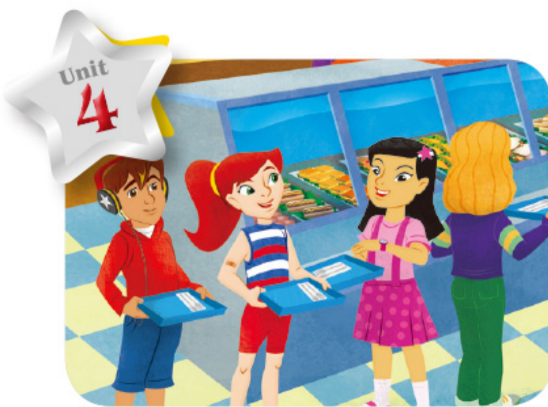
Lunch Time 32

long vowel i -ice -ike -ine -ide -ite -ive