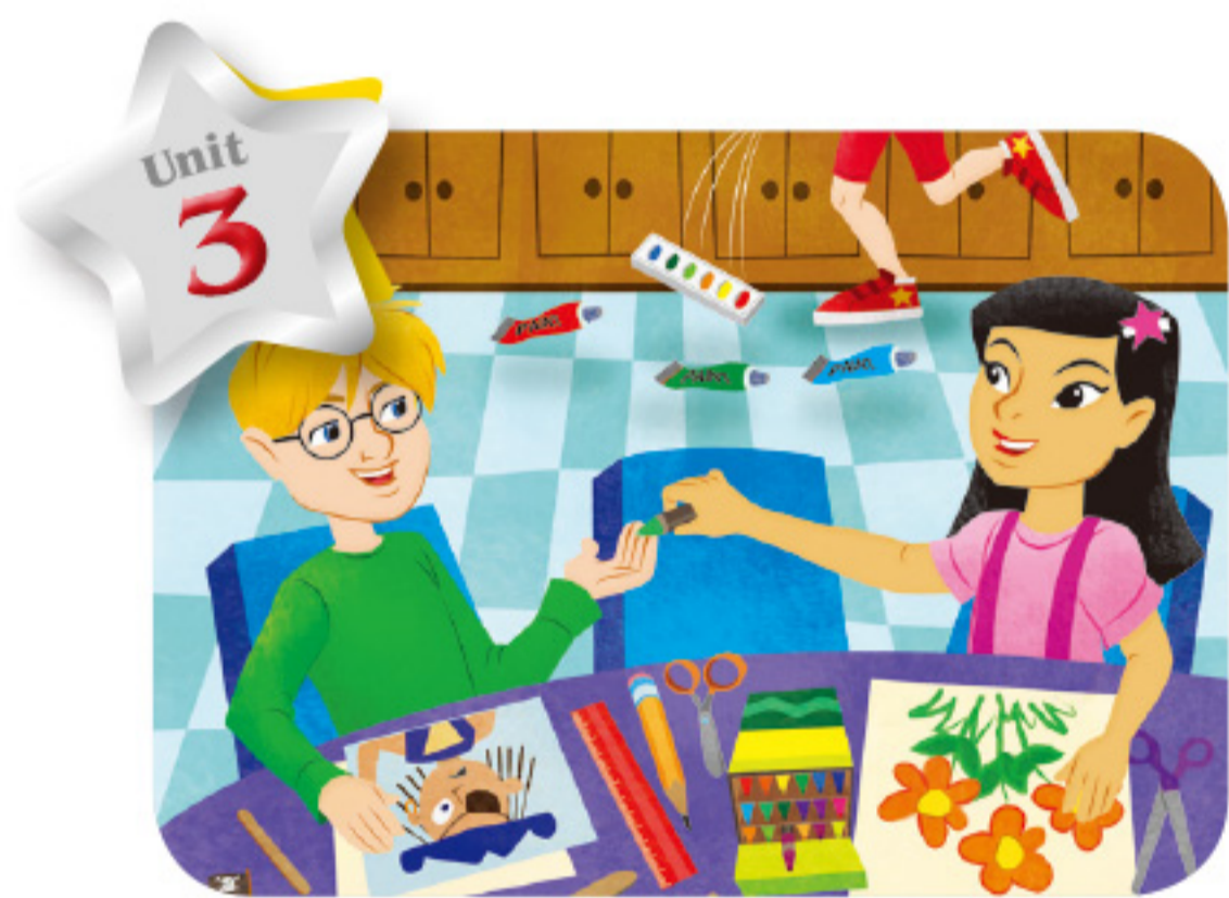
Art Class 24