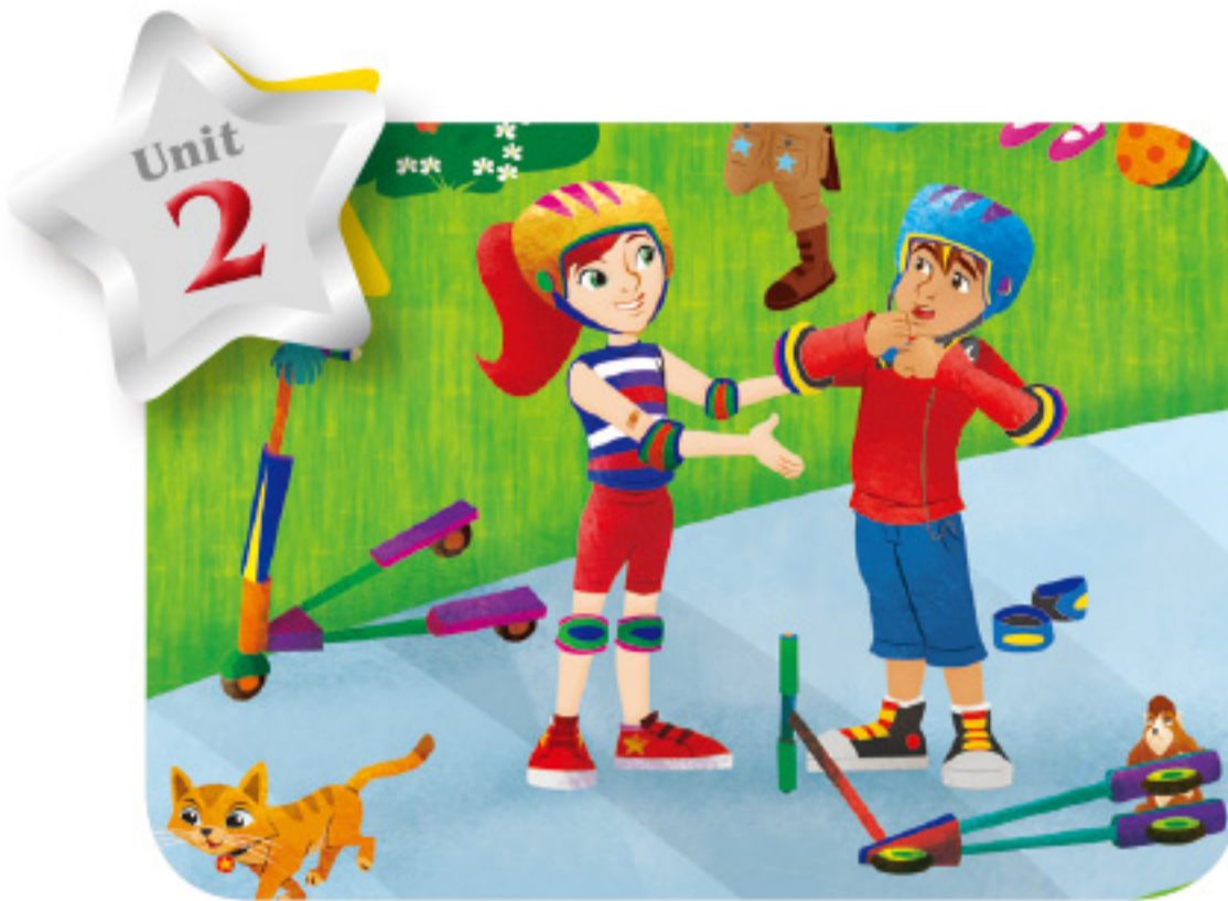
At the Park 14

long vowel a -ake -ase -ate -ame -ape -ave