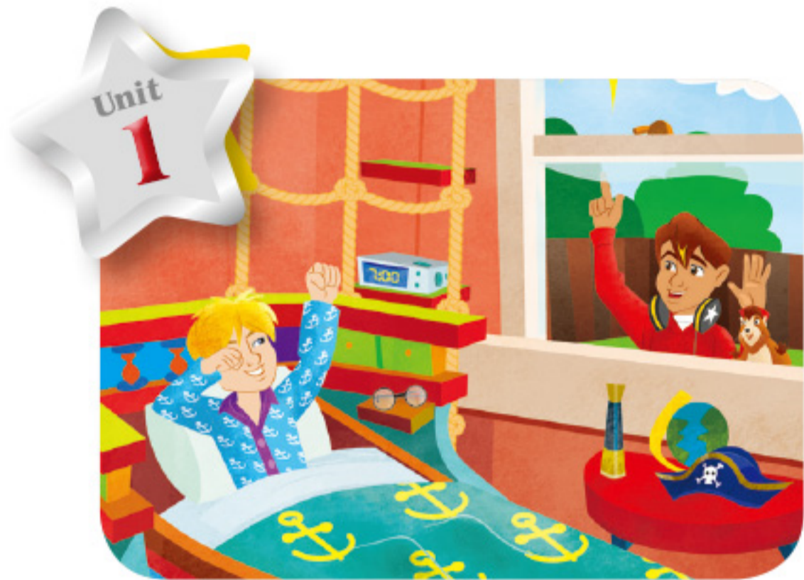
Sports Day 6