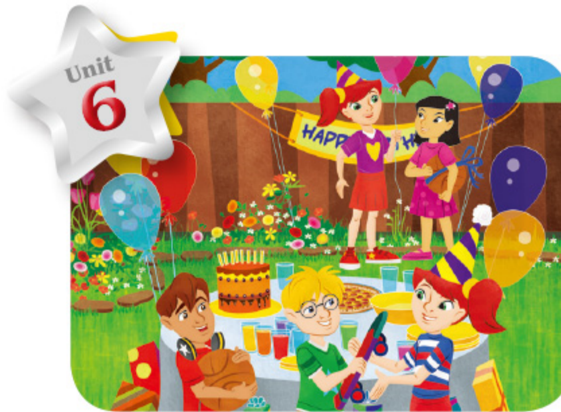
At the Birthday Party 56