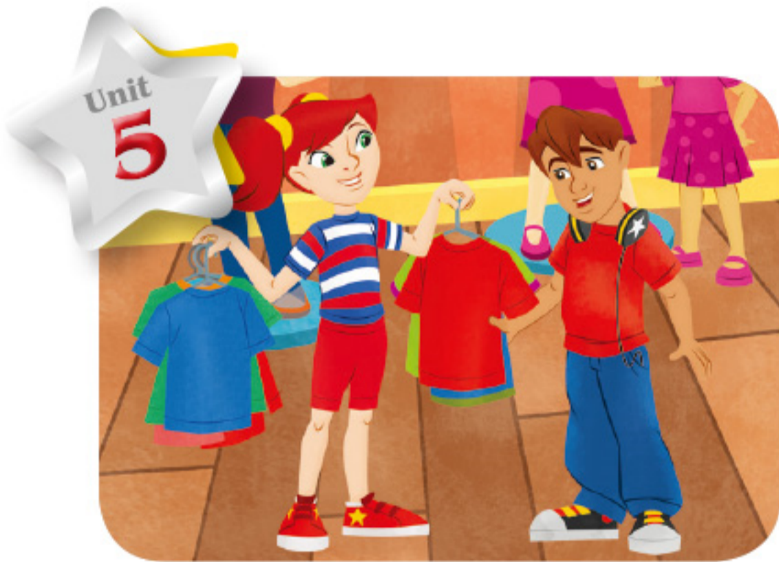
Clothing Store 48