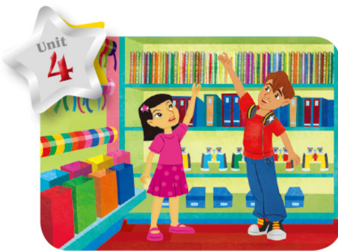
Stationery Store 32