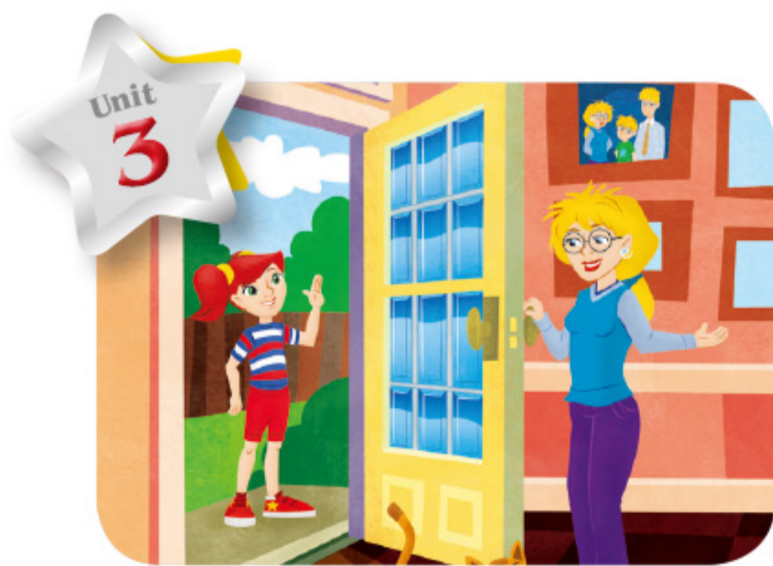
My Room 24